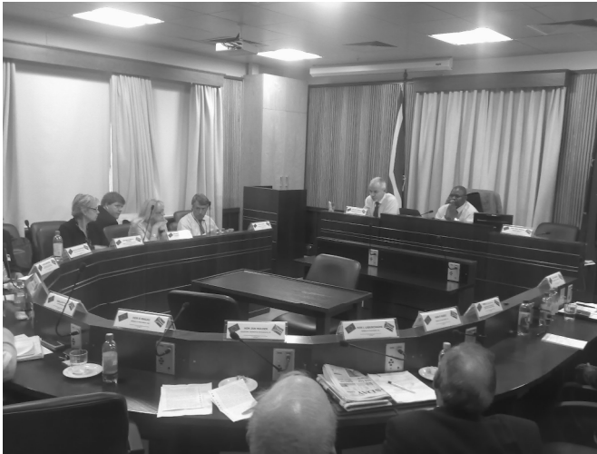
Second day of meetings with the SA Parliament