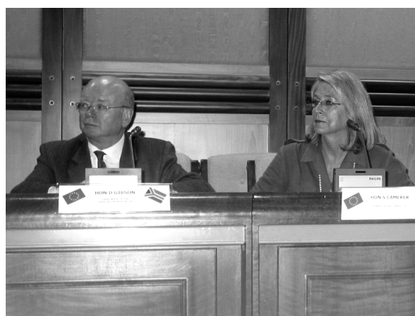
South African Parliamentarians (DA)

among the citizens of foreign countries who seek a better life in South Africa “ there are also criminal elements ”.