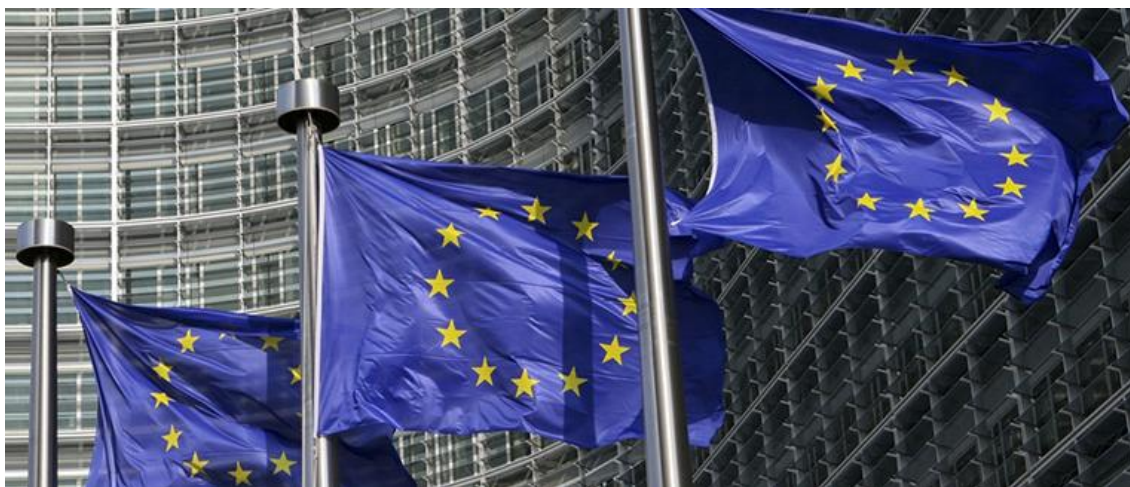
EU flags outside the european commission