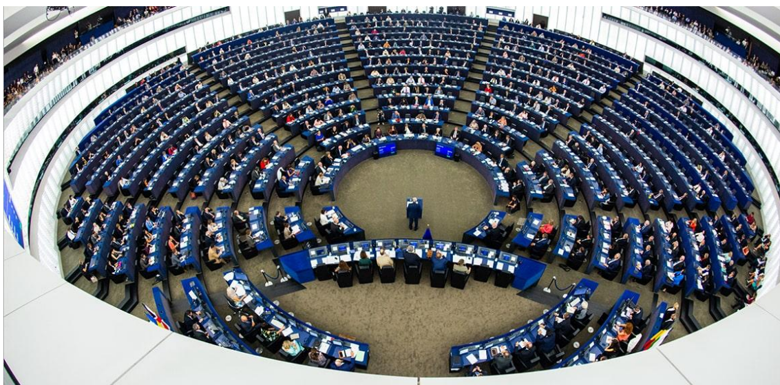
Plenary chamber of the European Parliament

On 23-26 May, more than 200,000,000 voters in 28 EU countries went to the polls to elect MEPs.